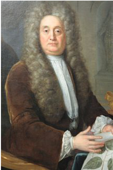
Figure 1. A portrait of Sir. Hans Sloane.

from the earth, and thus fixed, it would be a lasting bird, like the birds on the earth; and that it is the same with such things as are from hell. To this he added that had he known what he now knew of the spiritual world, he would have ascribed to nature no more than this, that it serves the spiritual, which is from God, in fixing the things which flow in unceasingly into nature. (DLW 344)