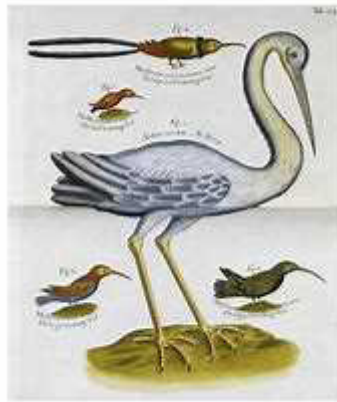
Figure 2. A picture in his book Voyage to Jamaica (public domain)

The following is a short article by Bishop deCharms in New Church Life , 1982.